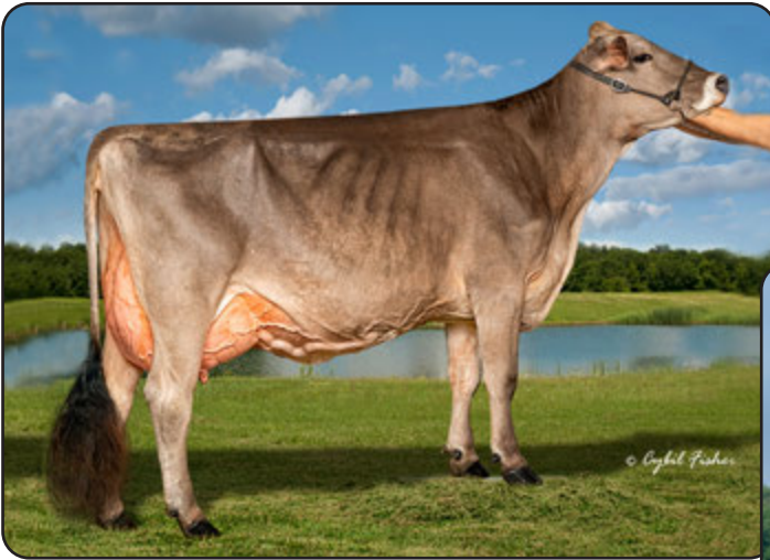
WF Biver Northernlights-ET "EX-94 2E" HM All-American Sr. 3 Year Old 2021 Granddam of Lot 24