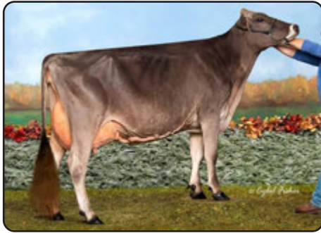
Kruses Victor Jiterbug-ET "EX-91" HM All-American Sr. 3 Year Old 2016 Granddam of Lot 1