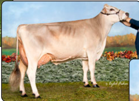
Brown Heaven J Fancy-ET "EX-91 2E" Nom. All-American Milking Yearling 2015 Granddam of Lot 7