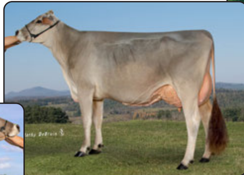
Cutting Edge WF Fargo "EX-93 2E" Nom. All-American Jr. 3 Year Old 2020 Third Dam of Lot 4