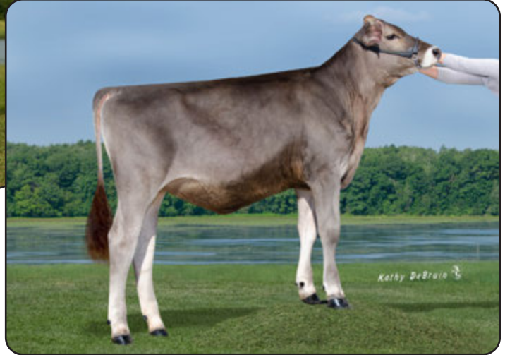
Just So W Nighttime Twin Lot 24