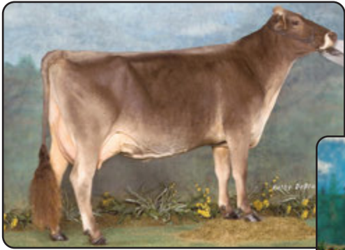
R & S Jetways Whitchaci-ET "EX-92 2E" HM All-American Sr. 3 Year Old 2005 Full Sister to Granddam of Lots 14 & 15