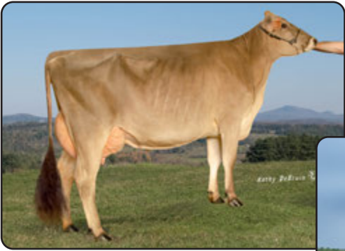
Just So V Fabulous "E-91" Maternal Sister to Lot 12