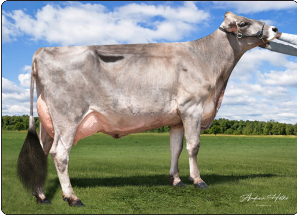
R N R Richard Prato "EX-90 EX-MS" Dam of Lot 8