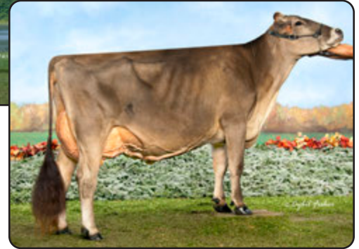
Cutting Edge Fawn "E-92" Res. All-American 4 Year Old 2018 Granddam of Lot 12