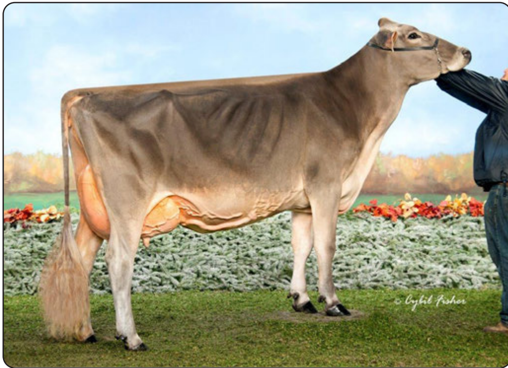
Rad-Ical Goliath Good Luck "EX-91 MS:90" All-American Sr. 2 Year Old 2018 Dam of Lot 13