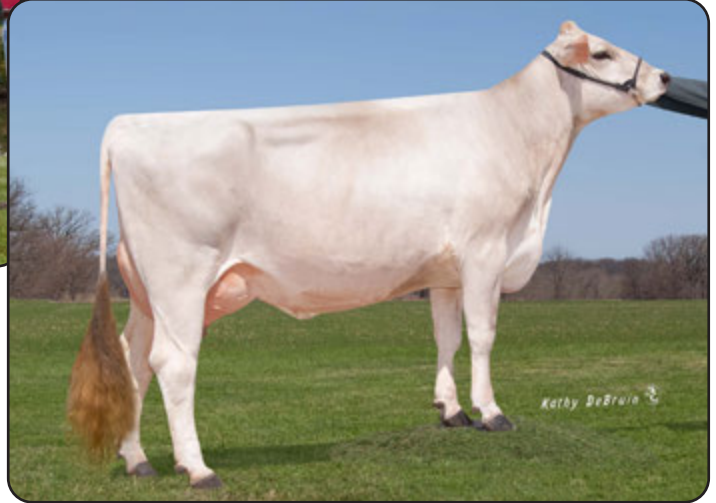
Cutting Edge L Suntan "EX-93" Third Dam of Lot 40