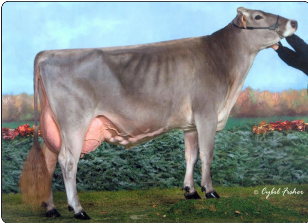
Dublin-Hills Treats "EX-94 2E" Grand Champion International Show 2011 Granddam of Lot 42