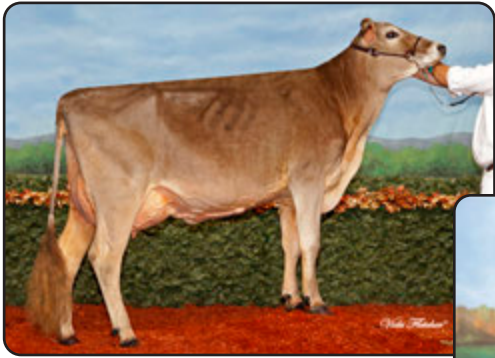
Brown Heaven Tract Sweet Dally "EX-91 4E" 3x All-Canadian Granddam of Lot 17