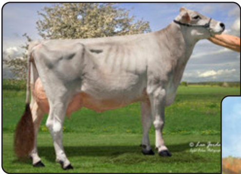
Brown Heaven N Falbala "2E-E92" Dam of Lot 7