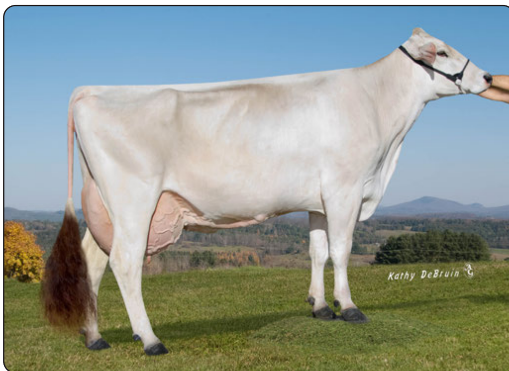
Manions Brook Riki-ET "VG-88 EX-MS" Granddam of Lot 18