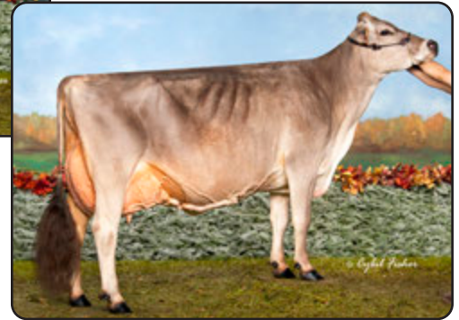
Brown Heaven Glenn Fantasy "EX-97 2E" 4x All-American Third Dam of Lot 7