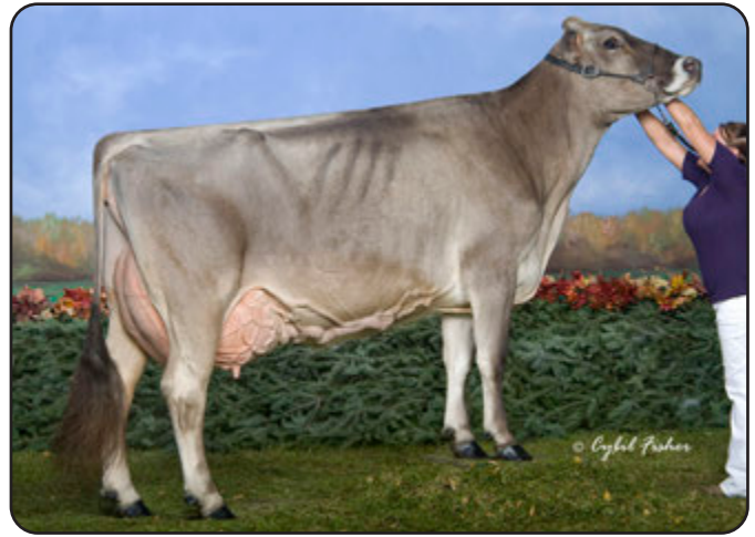
Voelkers Migel Candid "EX-94 4E"

Nom. All-American Sr. 3 Year Old 2021 Granddam of Lot 22