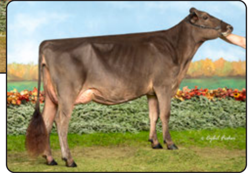
Pit-Crew Rampage Nola-OCS "VG-89" Res. All-American Jr. 2 Year Old 2023 Dam of Lot 45