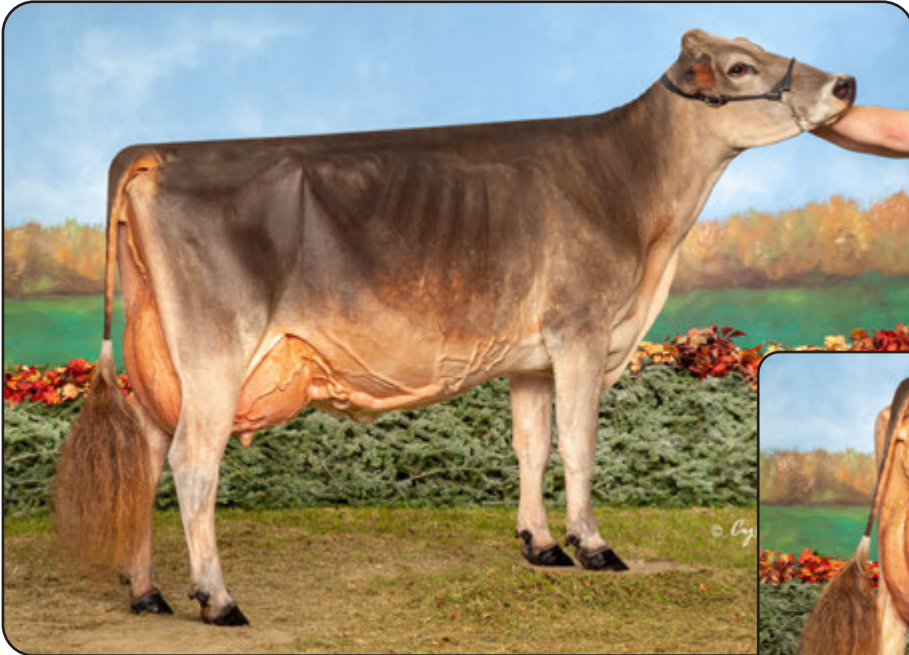
Groves-Sun Jonglr Teacup-ET "EX-94 3E" All-American 5 Year Old 2021 Full Sister to Granddam of Lot 21