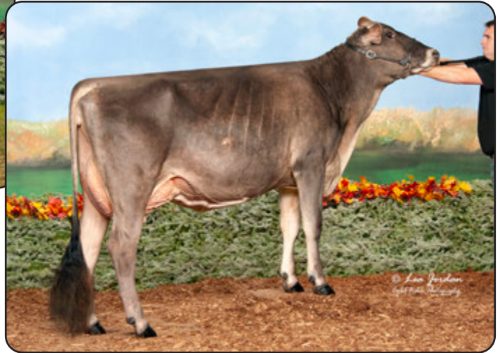
Edge View D Fern "VG-87" Nominated All-American Summer Jr. 2 Year Old 2023 Dam of Lot 2