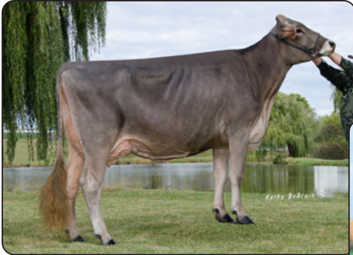
Brothers Three TV Wisco-ETV "2E-E93" 3x All-American nominee Dam of Lot 3