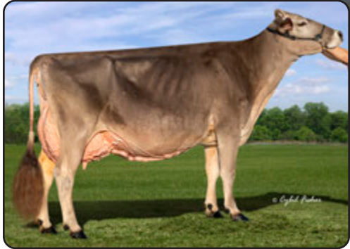
Cutting Edge Thunder Faye "EX-95 3E" 2x Grand Champion International Show Fourth Dam of Lot 4