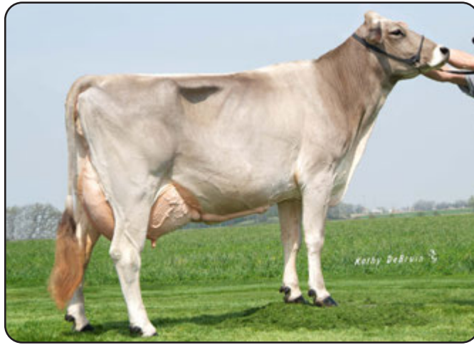
SCF James Vix "EX-94 3E" 2x All-American nominee Fourth Dam of Lot 37, Fifth Dam of Lot 38