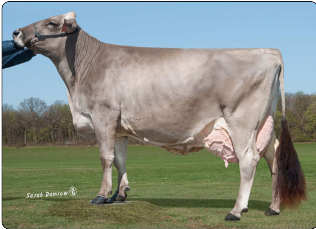
Top Acres JP Wisdom-ET "EX-91 3E" *Certified* Granddam of Lot 11