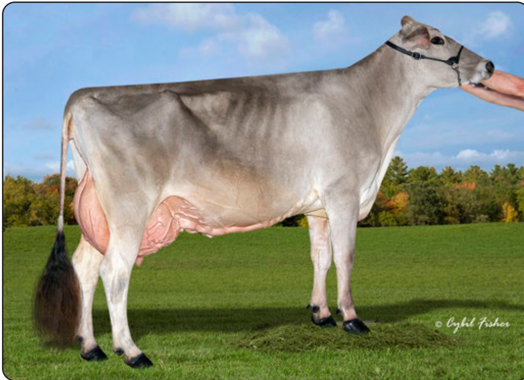
Cutting Edge F Diamond "EX-92 2E" Dam of Lot 43