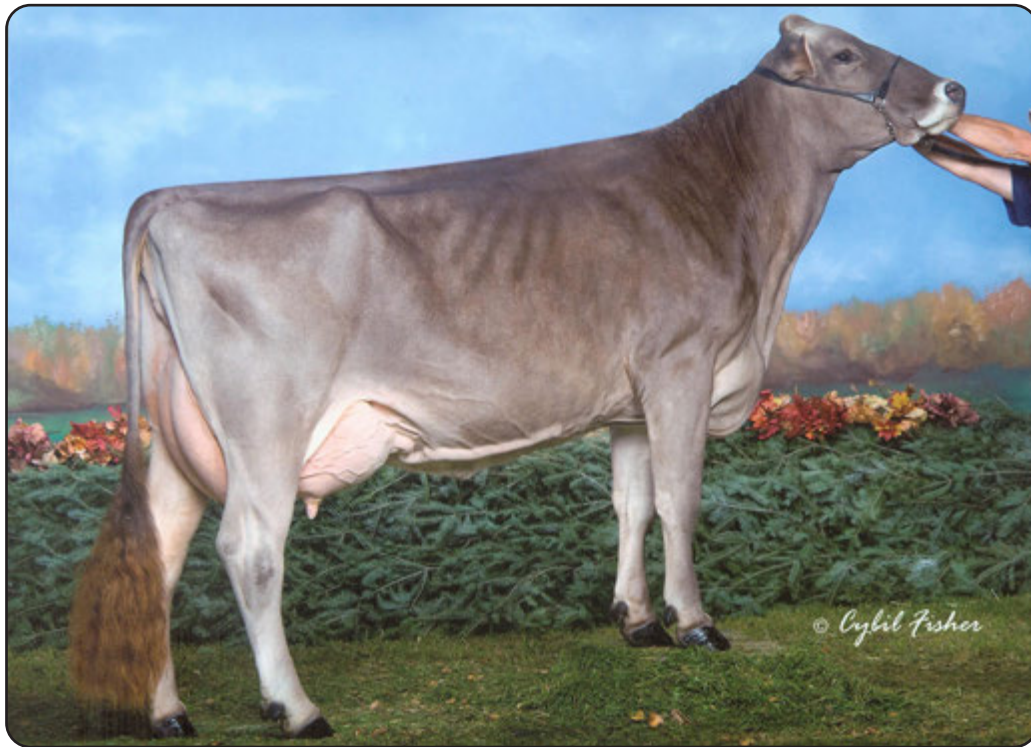
Kruses GK Jetway Miracle-ET "EX-90" Member HM All-American Produce of Dam 2009 Fifth Dam of Lot 10