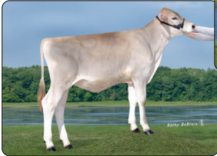
Just So S Wilder Lot 16