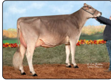
Kruses ACC C Jenesis-ETV "VG-89 EX-MS" Nom. All-American Milking Yearling 2023 Full Sister to Dam of Lot 1