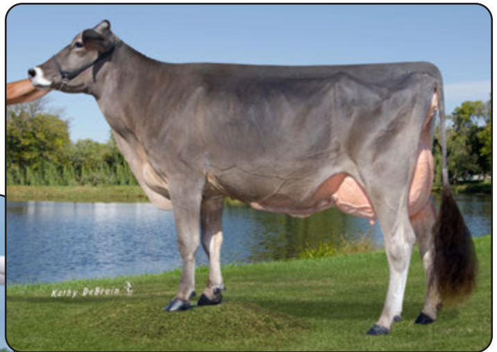
Just So P Wildflower-ET "EX-92" Res. All-American 4 Year Old 2021 Granddam of Lot 16