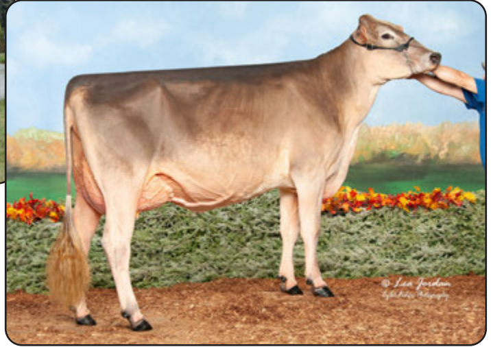
Topp B-3 Woodford "V-89" Unanimous All-American Jr. 3 Year Old 2023 Same Maternal Line as Lot 3