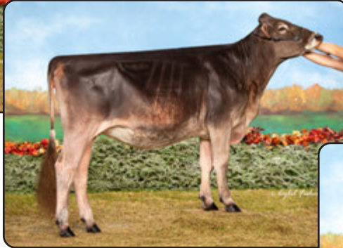
Pit-Crew Formula Nicky Res. All-American Winter Yearling 2021 Maternal Sister to Dam of Lot 45