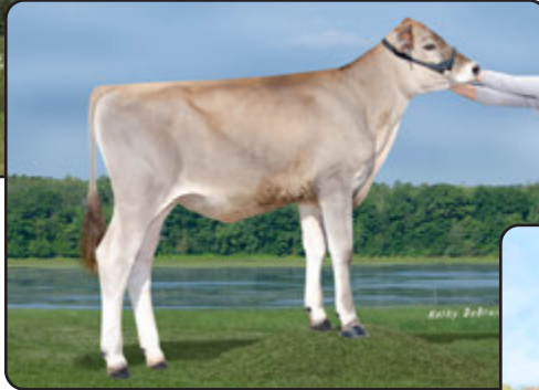
Just So C Fanny-ET Lot 12