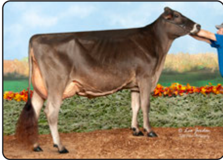
Kruses Moonlight Juliet-ET "EX-91" HM All-American Sr. 3 Year Old 2023 Maternal Sister to Dam of Lot 1