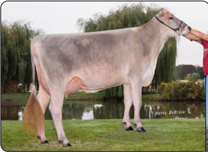
Just So T Sundrop "EX-90" Res. All-American Milking Yearling 2016 Maternal Sister to Granddam of Lot 40