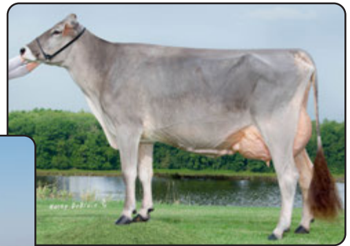
Just So D Fortune-ET "EX-91" Unanimous All-American Sr. 3 Year Old 2023 Full Sister to Granddam of Lot 4