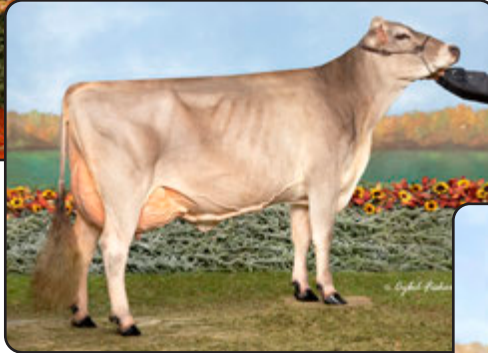
Brown Heaven F & F Sea Dally "EX-93" Same Cow Family as Lot 17