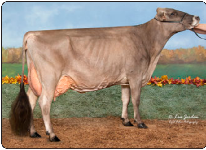
Double W Finn Mulberry "EX-92 MS:93"

Nom. All-American Sr. 3 Year Old 2021 Granddam of Lot 22