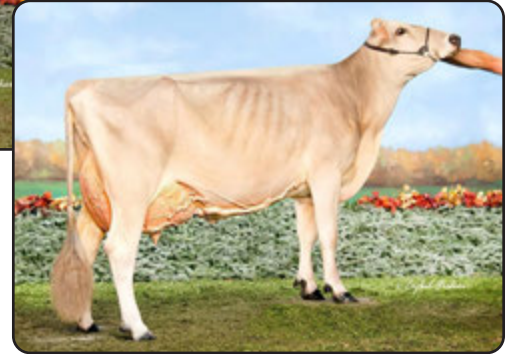
Brown Heaven B Sweety Dally-ET "EX-91 3E" Res. All-Canadian Jr. 2 Year Old 2017 Dam of Lot 17