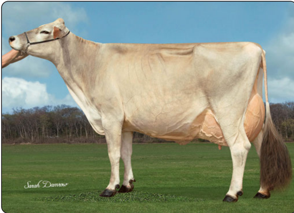
Cutting Edge D Dharma-ETV "EX-93 2E" Dam of Lot 44