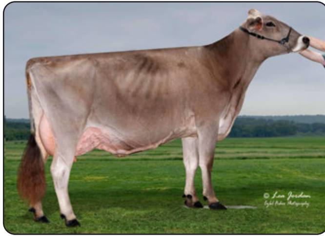
Cliff-Brook Zeus Maxine "EX-90 EX-MS" Dam of Lot 19