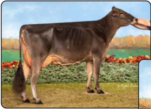
Pit-Crew Daredevil Noelle "EX-92 2E" 1st 4 Year Old MN State Show & State Fair 2022 Granddam of Lot 45