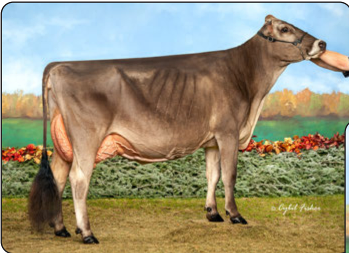
Cutting Edge F Faroh-ETV "EX-93 2E" All-American Sr. 3 Year Old 2021 Granddam of Lot 2