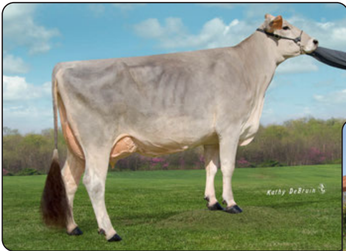
Just So L Winsome "EX-92" Maternal Sister to Dam of Lot 46