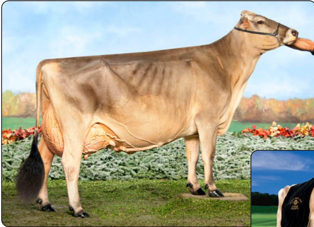
Cutting Edge Delilah "2E-E95" 2x Supreme Champion World Dairy Expo Dam of Lot 5