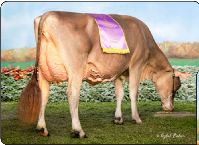
Jenlar Carter Waltz-ETV "E-91" All-American Jr. 3 Year Old 2019 Dam of Lot 6