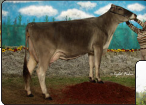
R & S Jetways Joy-ET "EX-90 2E" Nom. All-American Fall Calf 2001 Granddam of Lots 14 & 15