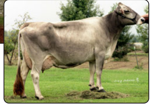
Alpine Hill Barbys Jo "EX-93 4E" *Cert* HM All-American Aged Cow 1990 Fourth Dam of Lots 14 & 15