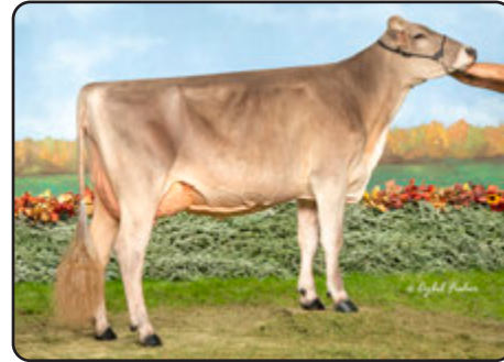
Kruses Carter Jive-ETV "VG-86" HM All-American Fall Calf 2021 Full Sister to Dam of Lot 1