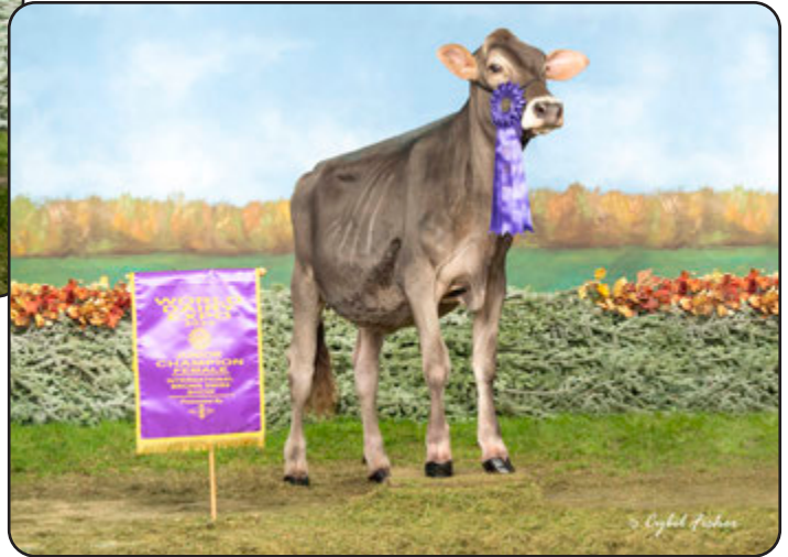
Jenlar Rasta Westlynn-ETV Unanimous All-American Fall Calf 2023 Maternal Sister to Lot 6